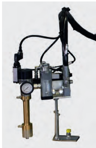
Cooled mixing unit