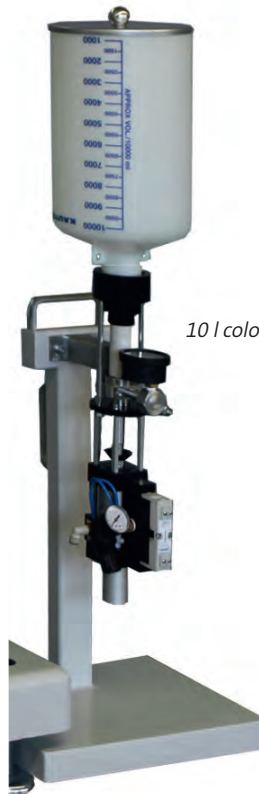
10 l colour supply pump