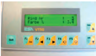
Proportional colour metering