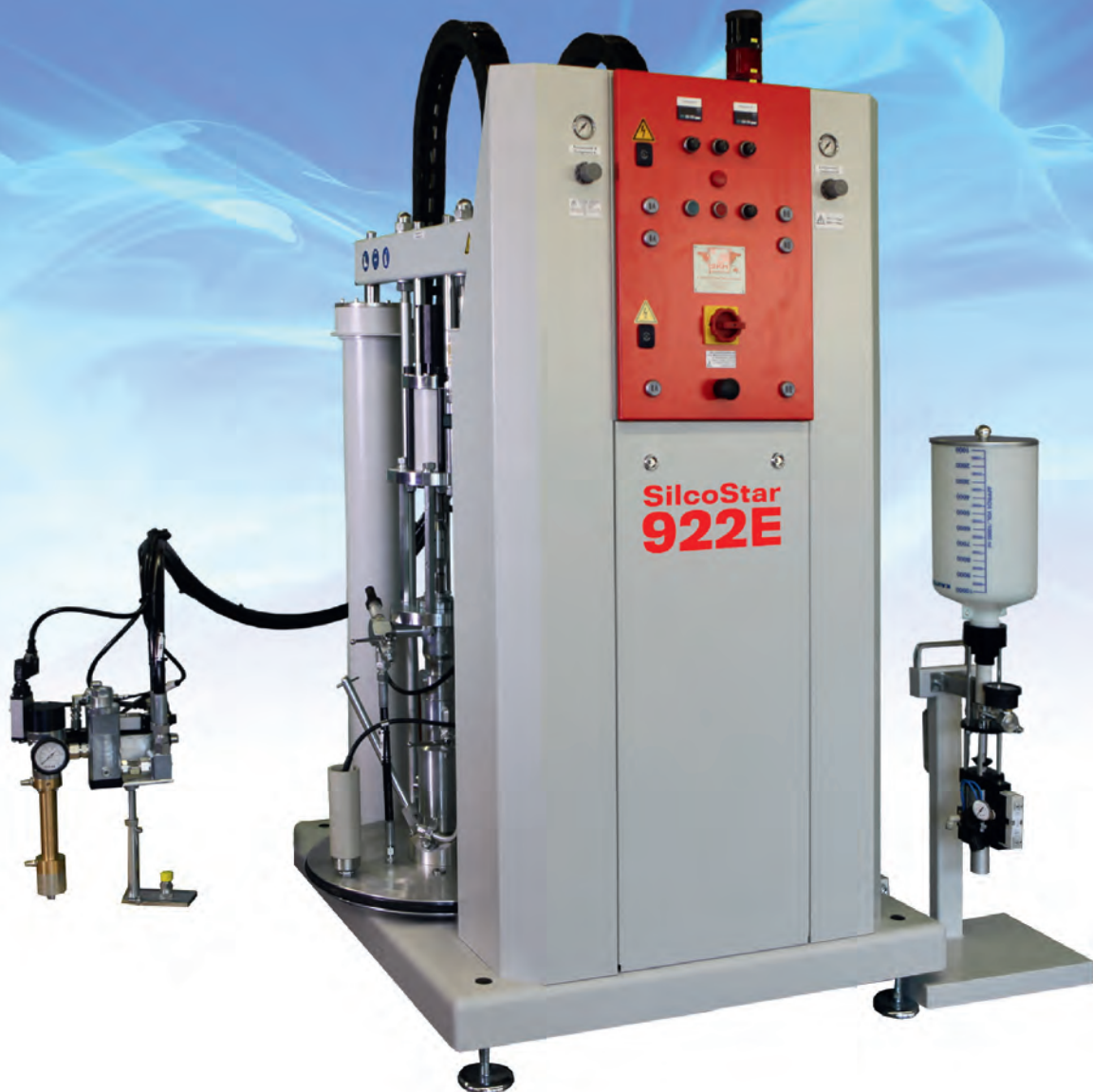
SilcoStar 922E Hydraulic driven Metering system for processing LSR