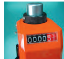
colour metering with metering valve and position indicator